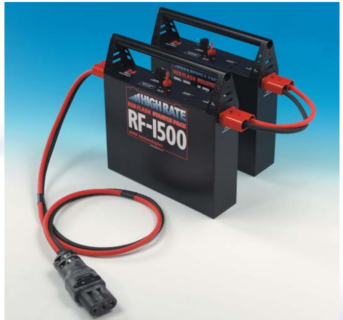
Dual Red Flash 1500 Pack shown, joined via link connector for double capacity (dual trolley available)